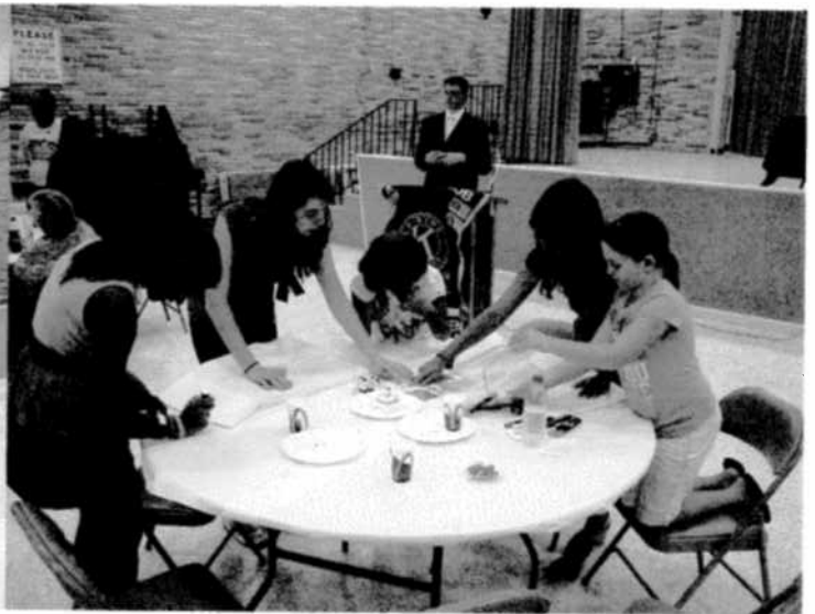
K-Kids & Key Clubber Make "pillow Hugs" for Injured Soldiers and Disabled Firefighters