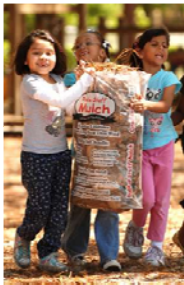
Fort Caroline Elementary School K-Kids Club Jacksonville, Florida

Spread mulch during a school cleanup project.