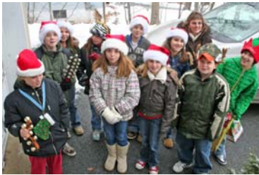
Providing gifts for the needy during the holidays.