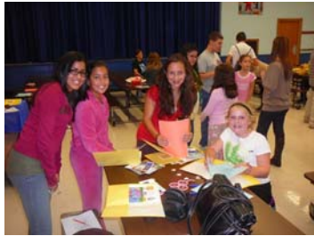
Making greeting cards for American veterans.