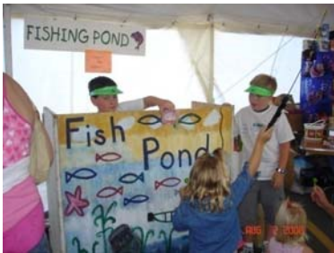
Helping at the school fair.