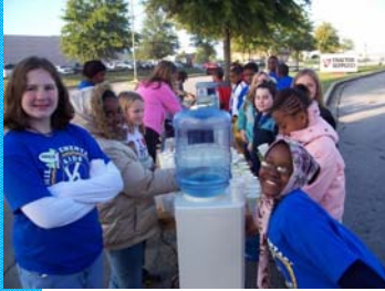
Milam Elementary School K-Kids Club Tupelo, Mississippi

Gave water to Race for the Cure race participants.